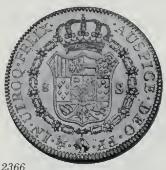
Lot No. 2366

8 Escudos, 1782 Mo-FF. 3rd Type. Obv. Large older bust. Rv. Larger and more curved crowned Arms in Fleece Collar; motto as before. Mintmark and Assayers' initials inverted. C-T 94, Fr.33. A stunning, cameo prooflike striking. The mirror fields very slightly disturbed, but Virtually As Struck. Rare in this condition.